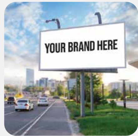
Bill Board (Size: 10x10 ft.)