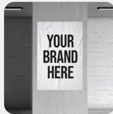
Pillar Branding (Size: 2x15 ft.)