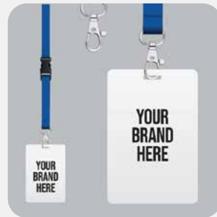
Badges with Lanyard