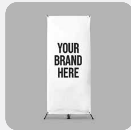
Standees (Size: 02x06 ft.)