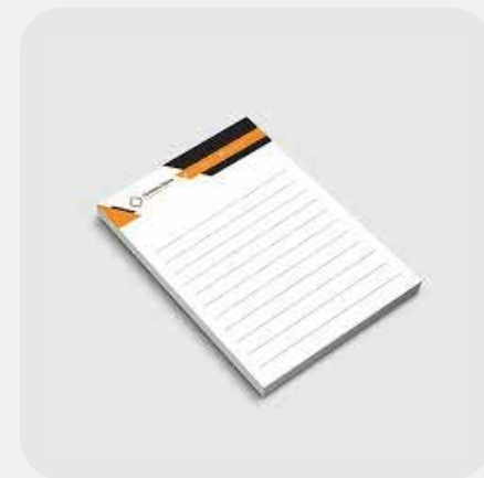
Notepad (1000 nos)