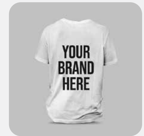
T-shirt Back Side Branding